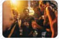
BARS & NIGHTCLUBS