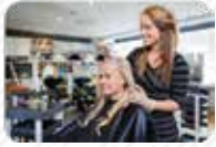
SALONS & SPAS