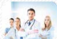
MEDICAL & LEGAL