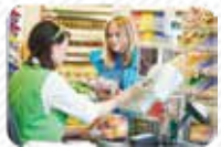
DELI & SUPERMARKET